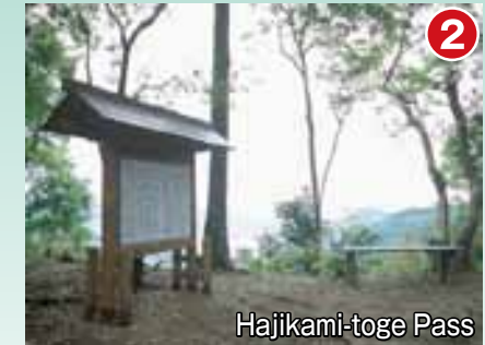
Hajikami-toge Pass Elevation 147 meters. There used to be a tea house here where travelers could take a break. All that is left now is the foundation.