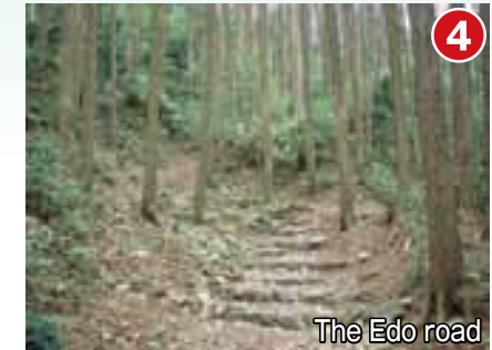
The Edo road These steps are only paved with stone on the front edge. On a rainy day the road would get muddy and straw sandals (the common footwear of the day) would require periodic cleaning. In several places along the way, you can find drainage gutters crossing the path, which both protected these roads from erosion and provided a place to wash the mud out of your sandals.