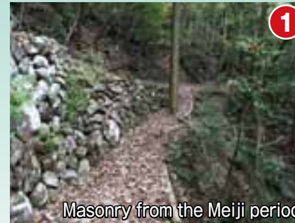
Masonry from the Meiji period Here and there along this road you can see excellent stonework from the Meiji era (1858-1912).