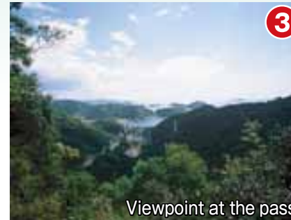
Viewpoint at the pass The islands of Kii Matsushima seem to be floating in the sea of Kumano makes for a spectacular view. On a clear day you can see all the way to the Shima peninsula 45km to the NE.