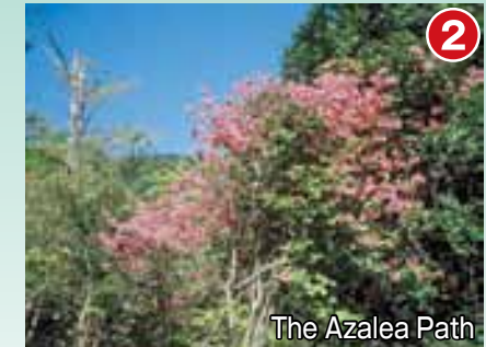
The Azalea Path

Travelers always used this rock as a bench, so it got the name, "Iko Ishi" or The Rest Rock. The cool wind coming over this ridge makes it an excellent place to take a break.