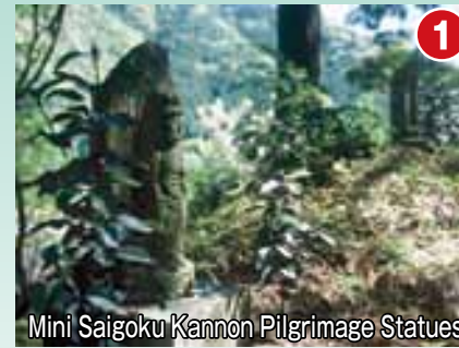
Mini Saigoku Kannon Pilgrimage Statues The dethroned Emperor Kazan on a pilgrimage to Kumano Kannon Pilgrimage of 33 Buddhist temples worshiping deities of mercy. The 33 statues of mercy here on this miniature version represent each of the temples on the official pilgrimage.