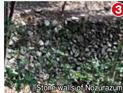
Stone walls of Nozurazumi Along the valley, you can see stone walls here and there. Their history goes way back, and they have protected the road from years and years of wind and rain erosion.