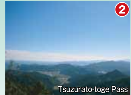
Tsuzurato-toge Pass Elevation 357 meters. This is the first point where pilgrims heading to the Kumano Three Grand Shrines first get a look at the Sea of Kumano.