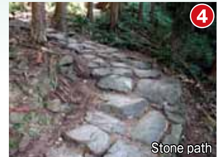
Stone path The stone path zig-zags its way through the lush green of the ferns, it almost looks like stitching by a seamstress.

■ Distance / Approx. 9.5Km from Umegadani Station to Kii-Nagashima Station ■ Walking time / 4hrs. ■ Level / ★★★ ■ The Course / This pass was at one point, the border between the province of Ise and the province of Kii. About 300 years ago when Nisaka Pass replaced this path as the main road and gateway to Kumano, this was only used by locals to get to the next village until the 1930s. The well preserved stonework makes the steep switchbacks worth the work.